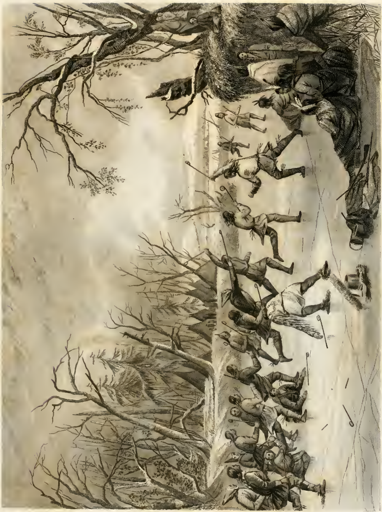
BALL PLAY ON THE ICE.